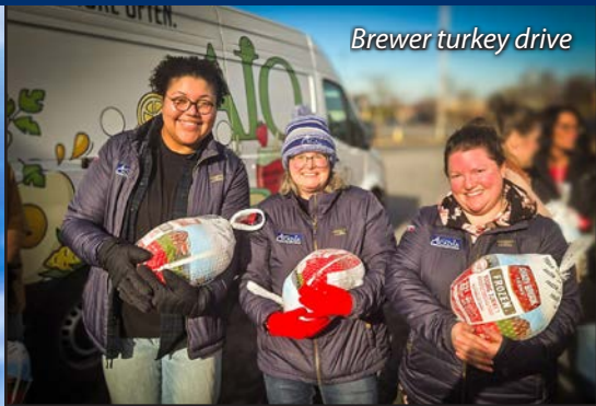
Brewer turkey drive