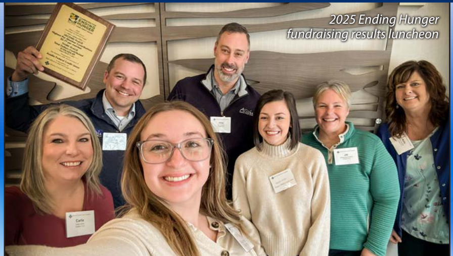
2025 Ending Hunger fundraising results luncheon

In 2025, Acadia FCU proudly helped make a meaningful impact in the Maine Credit Union Campaign for Ending Hunger, raising an incredible $103,024.09 , our highest total to date. This achievement placed us third among all Maine credit unions and second in the state for per-member contributions, a true testament to the generosity of our members and communities.