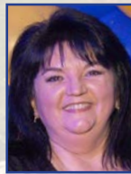
Julie Hayes Collaboration Award