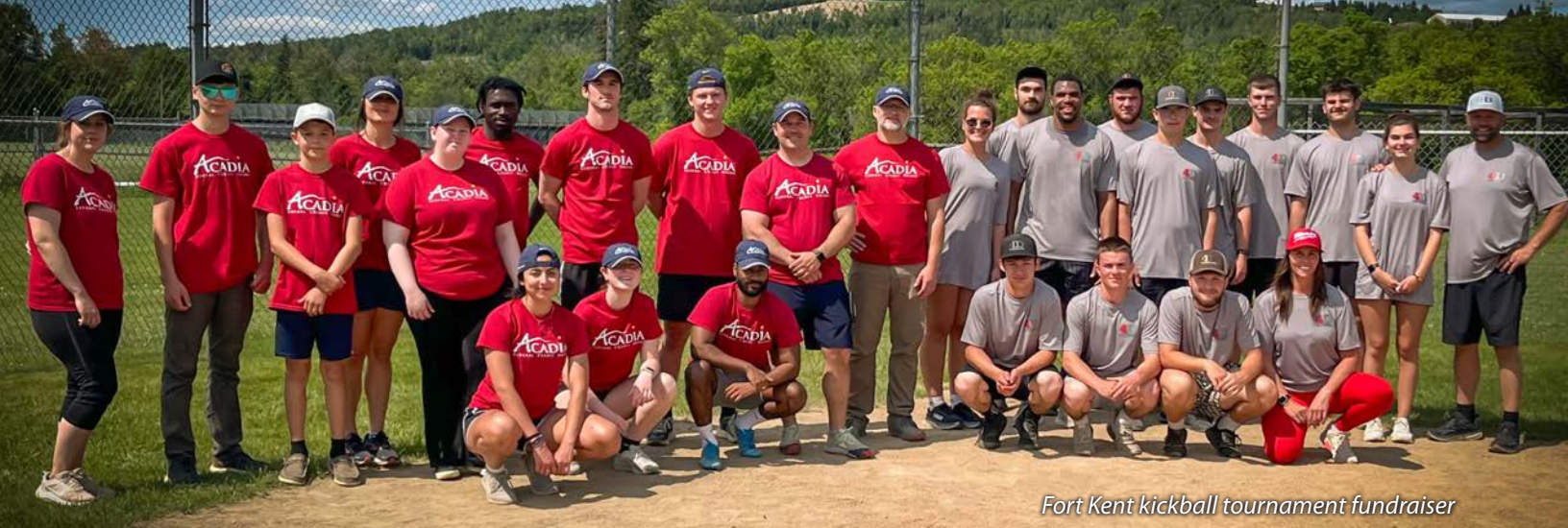
Fort Kent kickball tournament fundraiser