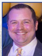
Justin Dubois Community Heart Award