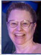
Esther Cote Leadership Impact Award