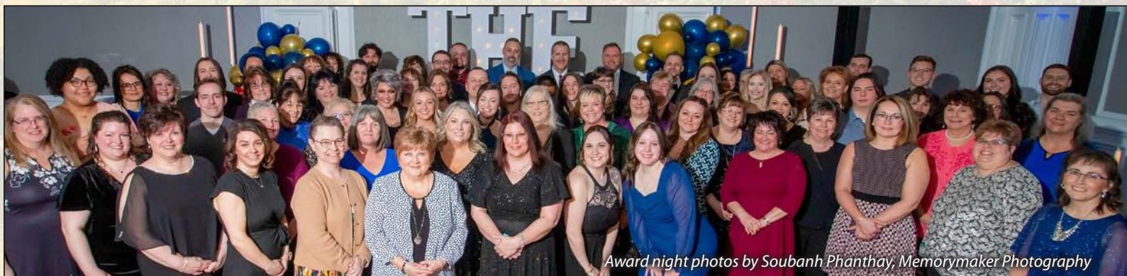
Award night

The Acadias marks the beginning of a new tradition. One that ensures the dedication, heart, and impact of our team members are celebrated year after year.